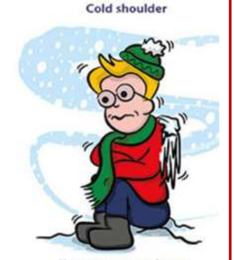
To pay no attention to.