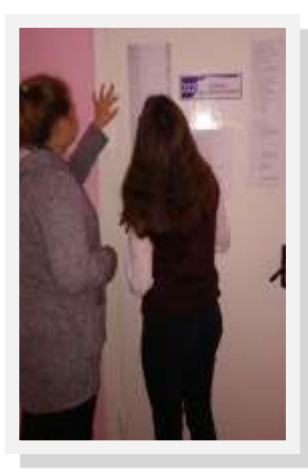
fet's do the quiz!

Probably, each of us loves travel, to but unfortunately not everyone has an opportunity to go to the country we very interested in. Only on the day of European languages everyone had a wonderful chance to go on a mini-trip to the most beautiful places in Europe. This journey was like a game of stations. Children moved along the arrows from one station to the other and at each station they could find interesting tasks to do. They needed to show their erudition and knowledge both of the country and the language because all tasks were in English.